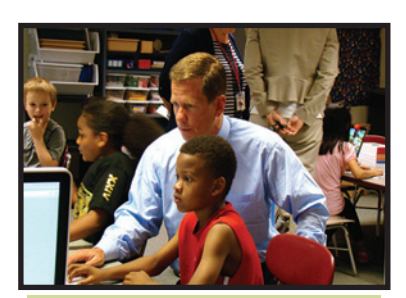
Congressman Dold & D56 student

Specifically, Title I dollars are oftentimes used to hire additional staff, and school districts are required to pay nearly a 40% fee when using Title I dollars for that