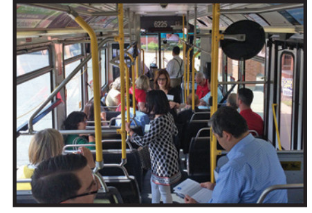
ULI panelists tour Gurnee by bus

A public meeting to present the TAP recommendations is being planned for mid to late-August. For updates and more information, check the Village's website at www.gurnee. il.us, follow our Facebook at www.facebook.com/VillageofGurnee/ and sign up for our East Grand Listserv at www.gurnee.il.us/subscribe for email updates.