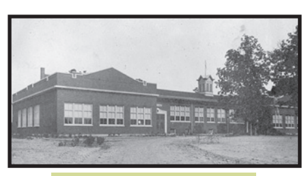
O'Plaine Campus, 1927

The 2016-2017 school year marks the centennial anniversary of Warren Township High School, Celebrating 100 Years of Excellence. We are proud that for the past century we have helped support the growth and achievement of students in Warren Township. We are excited to celebrate the upcoming centennial year with our past, present and future Blue Devils and the entire community. 100 events and activities have been