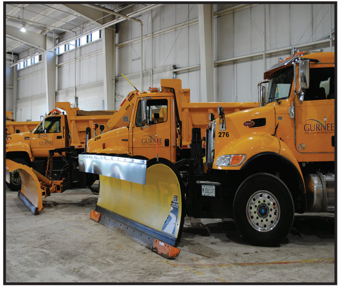
Gurnee's Snow Plow Fleet is ready for the winter season. The Village Snow Fleet includes 23 trucks on routes and 4 on standby

For any questions, see the full Snow & Ice Control Plan on the Village's website at www. gurnee.il.us/public_works/street/plowing or contact the Department at (847) 599-6800.