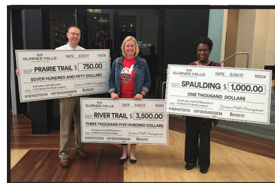
"Bucks for Books"

“It takes a Village” is a phrase used to describe the importance of the “all in” philosophy necessary when educating all children. As part of a Professional Learning Community, by definition, every adult who is part of the Gurnee District 56 school community is responsible for the education of every child. By extending that definition beyond the school walls and into our community and beyond, the District has attempted to enlist as many partners as possible in offering all children a world-class education.