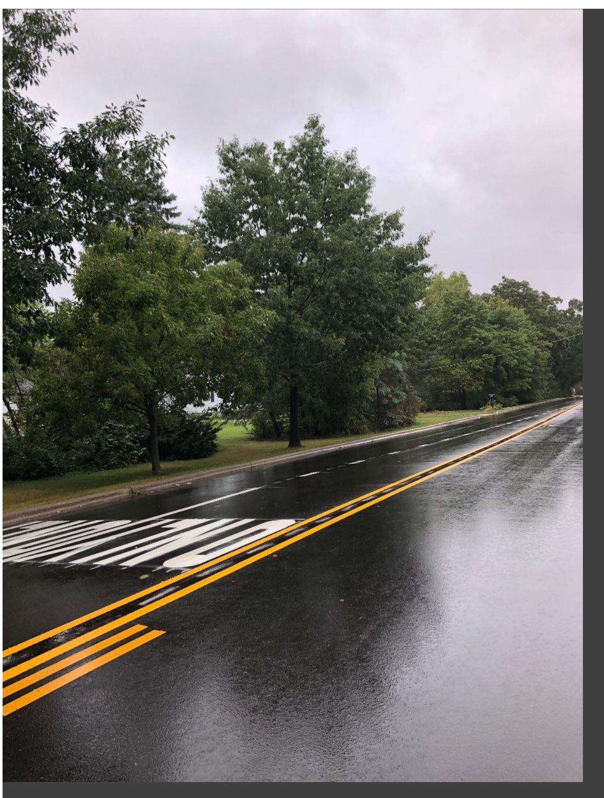
A newly resurfaced and painted roadway as part of the 2020 construction program.