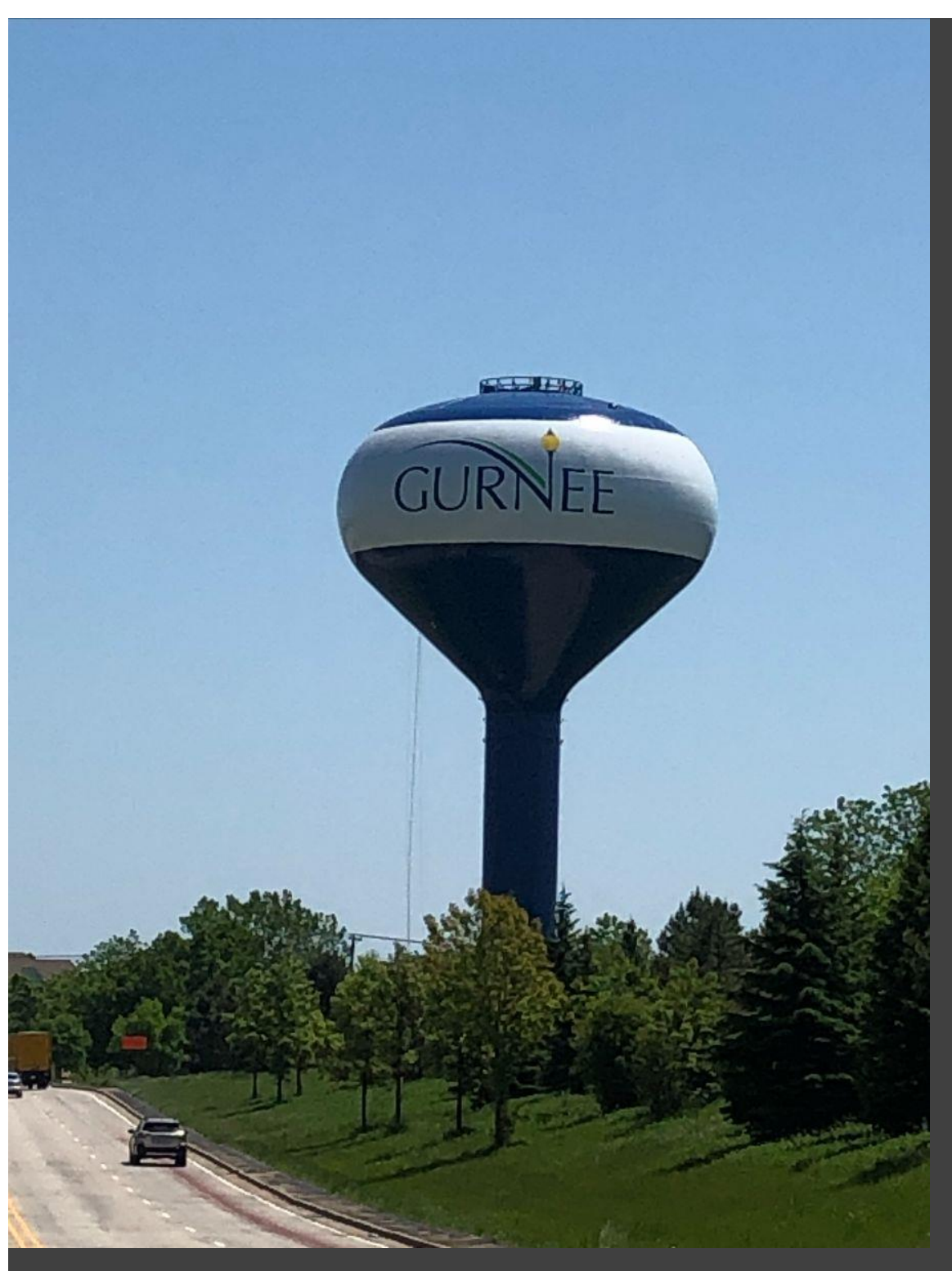
Knowles Road Water Tower painting is nearly completed. The final color will be blue, with a white band matching other Gurnee water towers. Knowles Road Water Tower #5 will be the first tower with Gurnee's new logo.