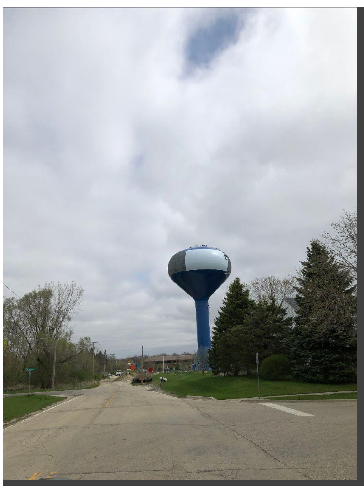
Knowles Road Water Tower is currently being painted. The final color will be blue, with a white band matching other Gurnee water towers. Knowles Road Water Tower #5 will be the first tower with Gurnee's new logo.