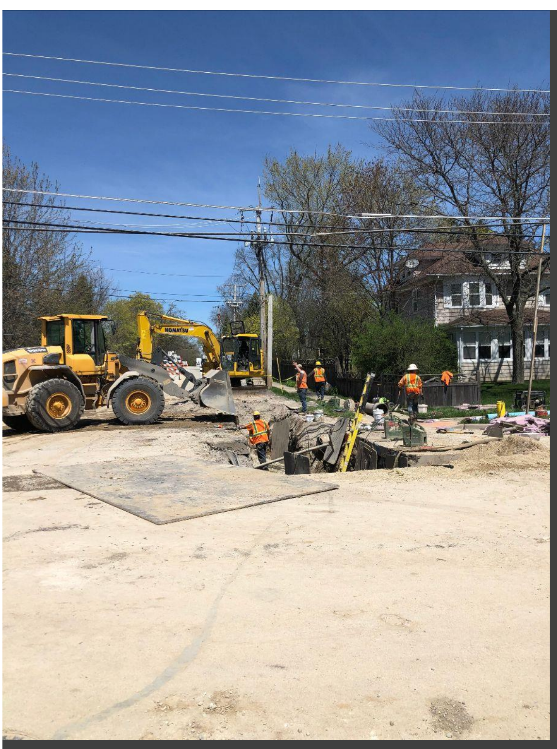
Main work on a section of Old Grand Avenue